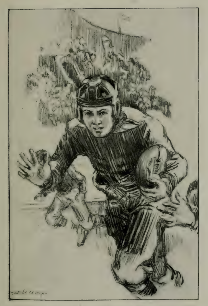
But Bannister did the unexpected